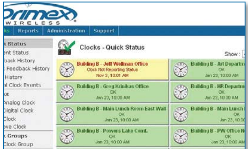
AMP Quick Status Page

Facility products that are able to monitor themselves through system software and communicate over the network when they need maintenance save significant overhead and labor cost over a product life span. This is achieved by the device automatically sending diagnostic information, rather than manually checking or waiting for problems. With SNS, if a clock or sensor device on the network needs attention or the equipment it is monitoring requires service, the Applications Management Platform (AMP) can alert the key people responsible for maintaining that particular device. The Primex Wireless AMP is a web browser based application accessible anywhere on your network.