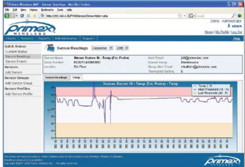
AMP Temperature Sensor Graph